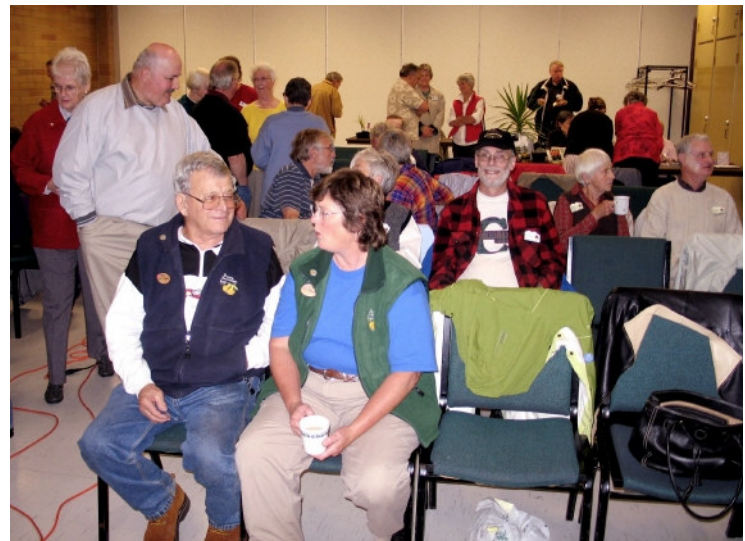
Happy crowd at Nanaimo joint meeting October 2007

The Rhodovine mailing is a very big expense for the club approximately $1.00 per copy per month. If you have an email be sure to let us know so that we can cut down the printing and mailing costs. Many thanks for your consideration.