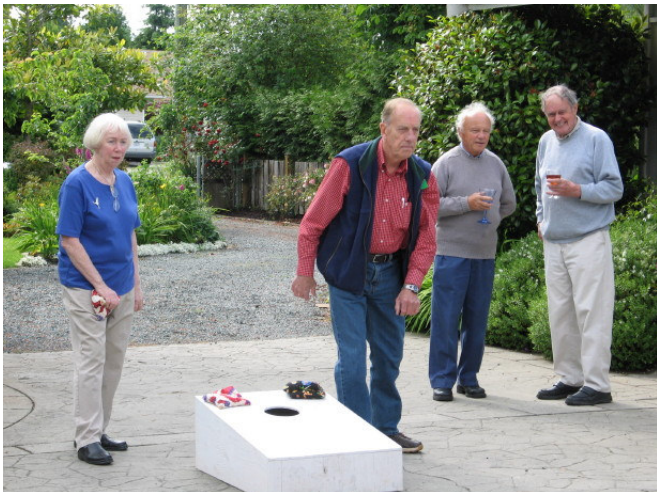
Party fun or is this is serious.

Guests are most welcome (guest fee $10).