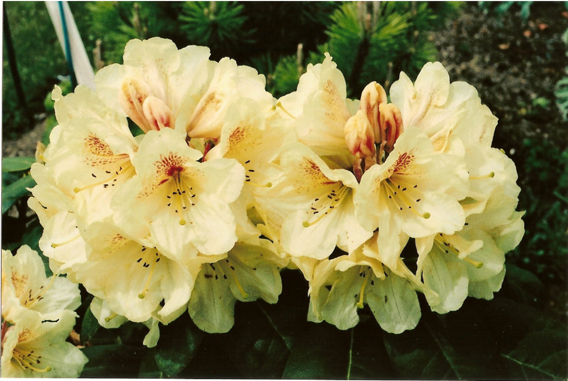
'Nancy Evans' (Ann's garden 2006. Photography by Lorraine Peters)